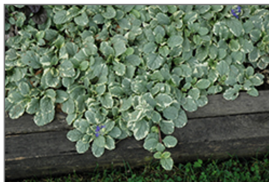
Silver Queen Bugleweed