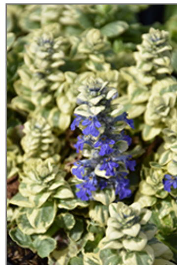
Silver Queen Bugleweed flowers