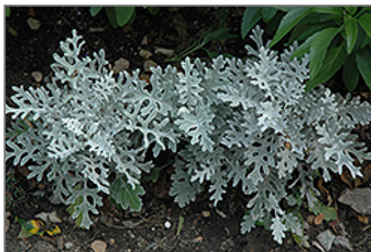
Silver Dust Dusty Miller foliage