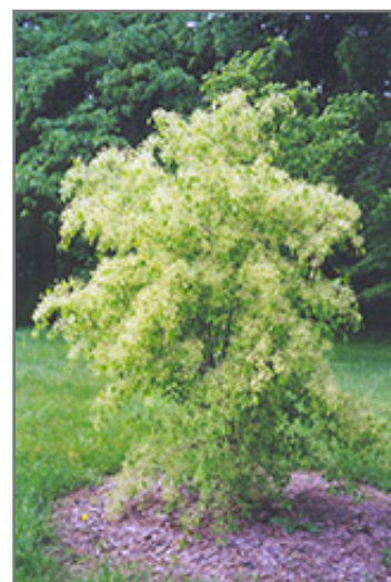
Maack's Spindle Tree in bloom