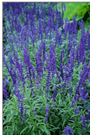
Victoria Blue Salvia flowers

Victoria Blue Salvia is a fine choice for the garden, but it is also a good selection for planting in outdoor pots and containers. With its upright habit of growth, it is best suited for use as a 'thriller' in the 'spiller-thriller-filler' container combination; plant it near the center of the pot, surrounded by smaller plants and those that spill over the edges. Note that when growing plants in outdoor containers and baskets, they may require more frequent waterings than they would in the yard or garden.