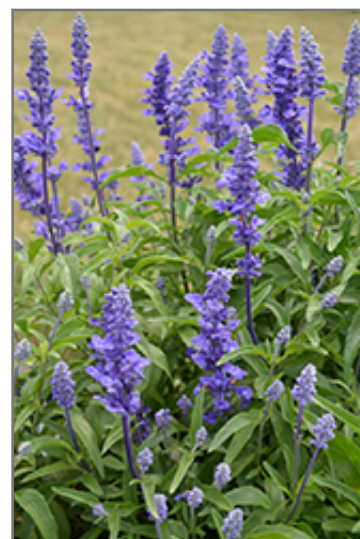
Victoria Blue Salvia flowers