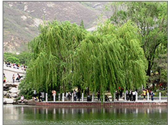
Weeping Hankow Willow

Weeping Hankow Willow will grow to be about 40 feet tall at maturity, with a spread of 40 feet. It has a low canopy with a typical clearance of 1 foot from the ground, and should not be planted underneath power lines. It grows at a fast rate, and under ideal conditions can be expected to live for 40 years or more.