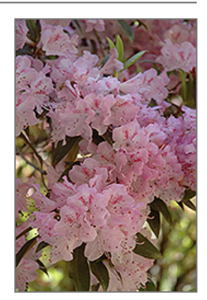
Wakehurst Rhododendron flowers

Wakehurst Rhododendron will grow to be about 7 feet tall at maturity, with a spread of 8 feet. It tends to be a little leggy, with a typical clearance of 1 foot from the ground, and is suitable for planting under power lines. It grows at a slow rate, and under ideal conditions can be expected to live for 40 years or more.