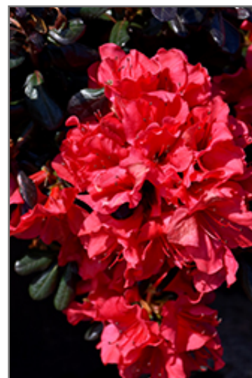
Johanna Azalea flowers