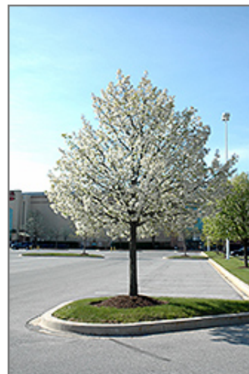
Jack Ornamental Pear in bloom