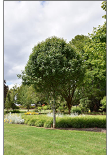
Jack Ornamental Pear

This tree should only be grown in full sunlight. It prefers to grow in average to moist conditions, and shouldn't be allowed to dry out. It is not particular as to soil type or pH. It is highly tolerant of urban pollution and will even thrive in inner city environments. This is a selected variety of a species not originally from North America.