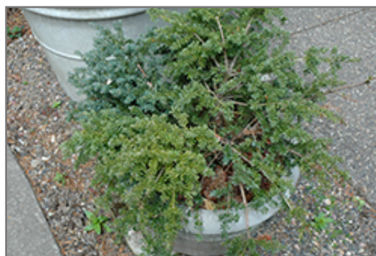
Blue Gem Mountain Plum Pine