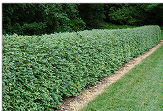
Winged Burning Bush