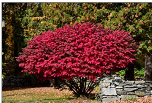
Winged Burning Bush in fall