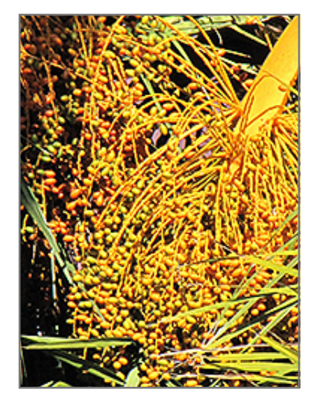
Canary Island Date Palm fruit