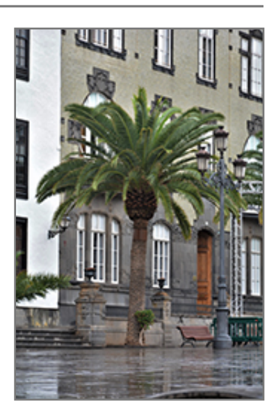
Canary Island Date Palm

This plant is not reliably hardy in our region, and certain restrictions may apply; contact the store for more information.