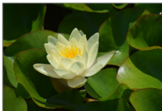
Marliacea Chromatella Hardy Water Lily flowers