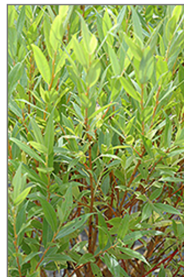
Flame Willow foliage