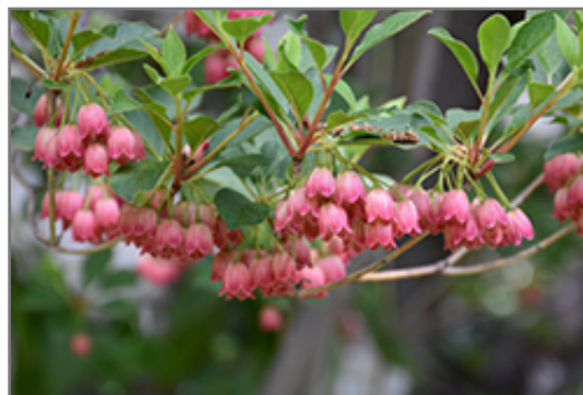
Redvein Enkianthus flowers