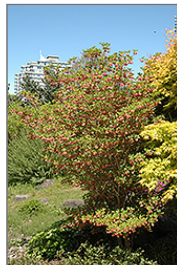
Redvein Enkianthus in bloom