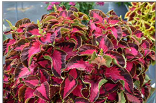
Chocolate Covered Cherry Coleus foliage