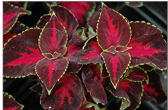
Chocolate Covered Cherry Coleus foliage