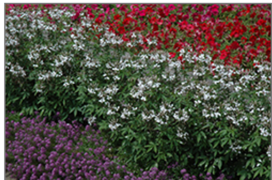
Senorita Blanca Spiderflower in bloom