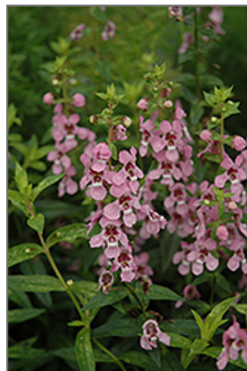
Serenita Lavender Pink Angelonia flowers

Serenita Lavender Pink Angelonia is recommended for the following landscape applications;