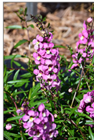
AngelMist Spreading Pink Angelonia flowers

AngelMist Spreading Pink Angelonia is recommended for the following landscape applications;