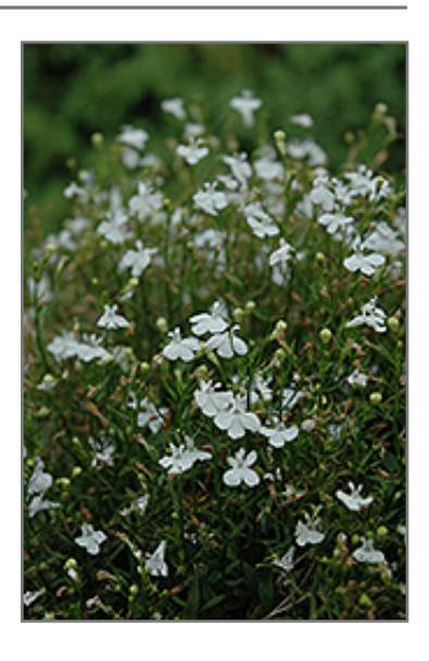
Waterfall White Sparkle Lobelia flowers

Waterfall White Sparkle Lobelia will grow to be about 8 inches tall at maturity, with a spread of 12 inches. When grown in masses or used as a bedding plant, individual plants should be spaced approximately 10 inches apart. Its foliage tends to remain low and dense right to the ground. Although it's not a true annual, this fast-growing plant can be expected to behave as an annual in our climate if left outdoors over the winter, usually needing replacement the following year. As such, gardeners should take into consideration that it will perform differently than it would in its native habitat.