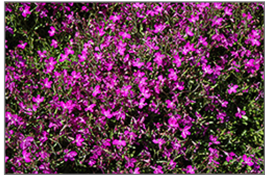
Techno Violet Lobelia flowers

Techno Violet Lobelia will grow to be about 8 inches tall at maturity, with a spread of 12 inches. When grown in masses or used as a bedding plant, individual plants should be spaced approximately 10 inches apart. Its foliage tends to remain low and dense right to the ground. Although it's not a true annual, this fast-growing plant can be expected to behave as an annual in our climate if left outdoors over the winter, usually needing replacement the following year. As such, gardeners should take into consideration that it will perform differently than it would in its native habitat.