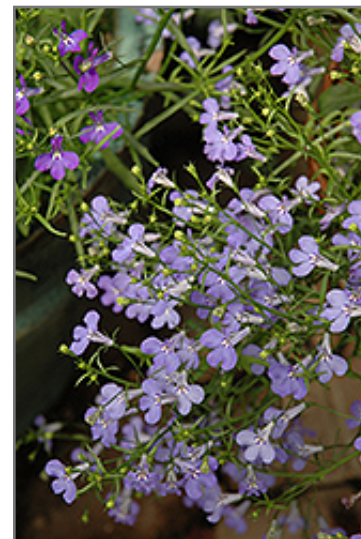
Laguna Sky Blue Lobelia flowers