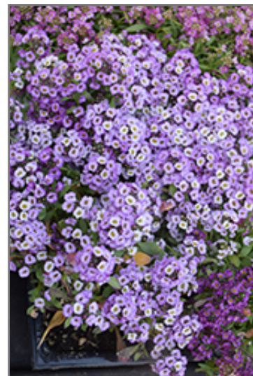
Clear Crystal Lavender Shades Sweet Alyssum flowers

Clear Crystal Lavender Shades Sweet Alyssum is recommended for the following landscape applications;