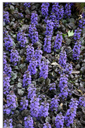
Black Scallop Bugleweed flowers

Black Scallop Bugleweed is recommended for the following landscape applications;