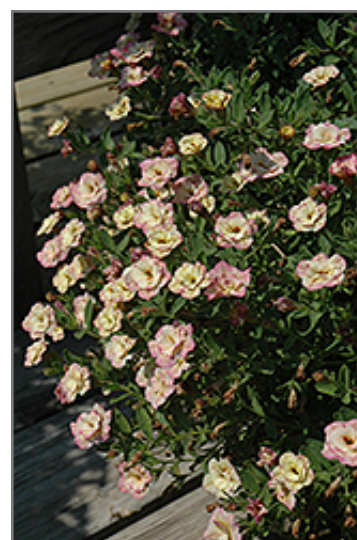
MiniFamous Double Rose Chai Calibrachoa flowers