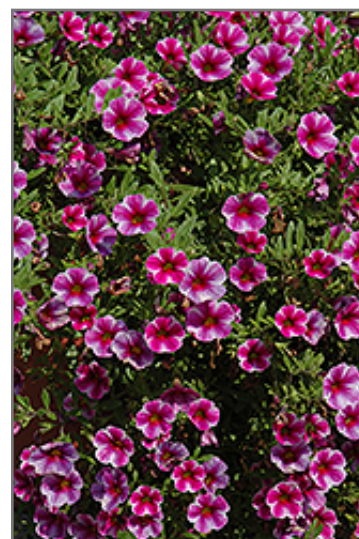
Can-Can Hot Pink Star Calibrachoa flowers

Can-Can Hot Pink Star Calibrachoa is recommended for the following landscape applications;