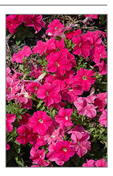
Pretty Grand Deep Pink Petunia flowers

Pretty Grand Deep Pink Petunia will grow to be about 8 inches tall at maturity, with a spread of 12 inches. When grown in masses or used as a bedding plant, individual plants should be spaced approximately 10 inches apart. Its foliage tends to remain low and dense right to the ground. This fast-growing annual will normally live for one full growing season, needing replacement the following year.