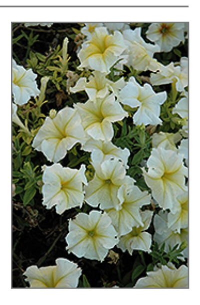
Paparazzi Glitz Yellow Petunia flowers

Paparazzi Glitz Yellow Petunia will grow to be about 12 inches tall at maturity, with a spread of 14 inches. When grown in masses or used as a bedding plant, individual plants should be spaced approximately 12 inches apart. Its foliage tends to remain dense right to the ground, not requiring facer plants in front. This fast-growing annual will normally live for one full growing season, needing replacement the following year.