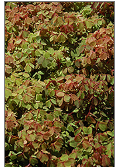
Sunset Velvet Shamrock foliage