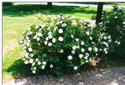
Henry Hudson Rose in bloom