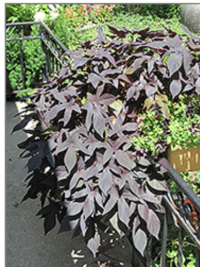
Proven Accents Blackie Sweet Potato Vine