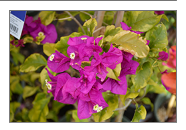
Golden Jackpot Bougainvillea flowers