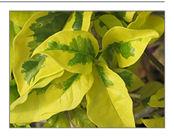
Golden Jackpot Bougainvillea foliage

This plant should only be grown in full sunlight. It prefers dry to average moisture levels with very well-drained soil, and will often die in standing water. It is considered to be drought-tolerant, and thus makes an ideal choice for a low-water garden or xeriscape application. It is not particular as to soil type or pH, and is able to handle environmental salt. It is highly tolerant of urban pollution and will even thrive in inner city environments. This particular variety is an interspecific hybrid. It can be propagated by cuttings; however, as a cultivated variety, be aware that it may be subject to certain restrictions or prohibitions on propagation.