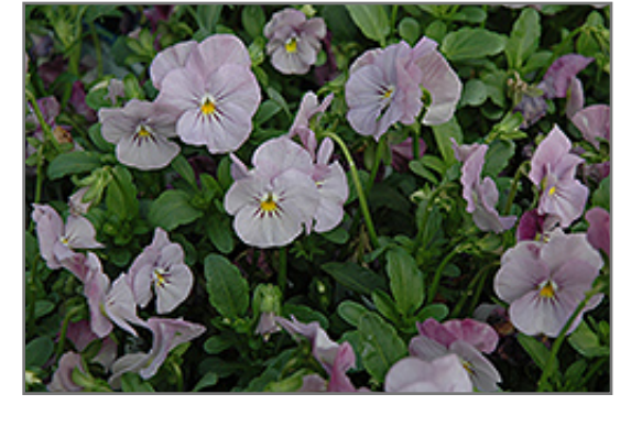
Sorbet Lilac Ice Pansy flowers