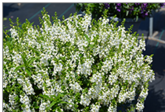
Serena White Angelonia in bloom