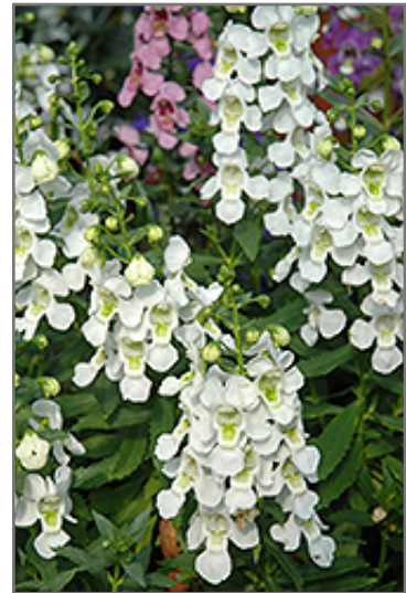
Serena White Angelonia flowers

Serena White Angelonia is a fine choice for the garden, but it is also a good selection for planting in outdoor containers and hanging baskets. With its upright habit of growth, it is best suited for use as a 'thriller' in the 'spiller-thriller-filler' container combination; plant it near the center of the pot, surrounded by smaller plants and those that spill over the edges. Note that when growing plants in outdoor containers and baskets, they may require more frequent waterings than they would in the yard or garden.