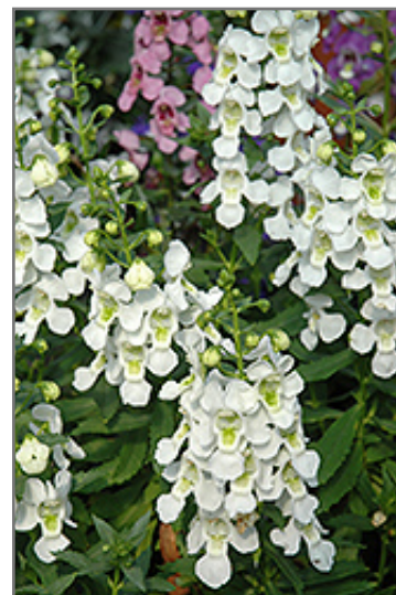
Serena White Angelonia flowers

Serena White Angelonia is a fine choice for the garden, but it is also a good selection for planting in outdoor containers and hanging baskets. With its upright habit of growth, it is best suited for use as a 'thriller' in the 'spiller-thriller-filler' container combination; plant it near the center of the pot, surrounded by smaller plants and those that spill over the edges. Note that when growing plants in outdoor containers and baskets, they may require more frequent waterings than they would in the yard or garden.