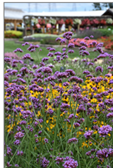
Buenos Aires Verbena flowers