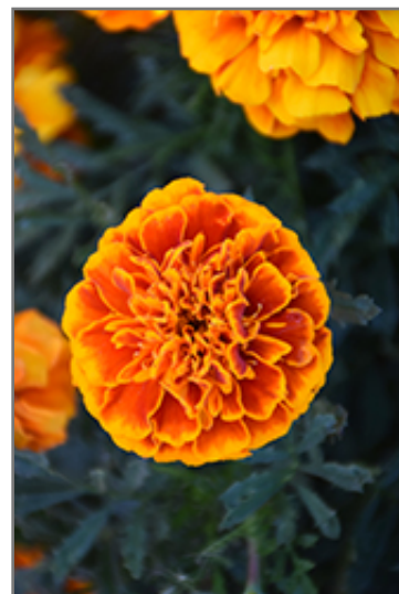
Bonanza Flame Marigold flowers

Bonanza Flame Marigold will grow to be about 12 inches tall at maturity, with a spread of 8 inches. When grown in masses or used as a bedding plant, individual plants should be spaced approximately 6 inches apart. Its foliage tends to remain dense right to the ground, not requiring facer plants in front. This fast-growing annual will normally live for one full growing season, needing replacement the following year.