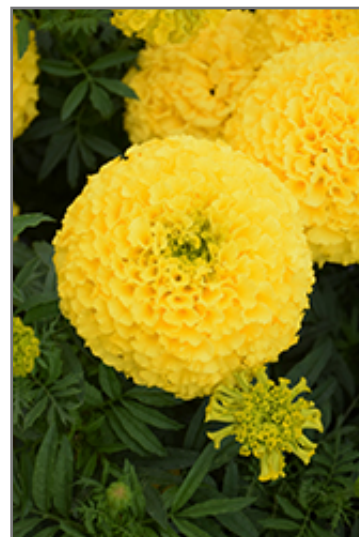
Marvel Yellow Marigold flowers