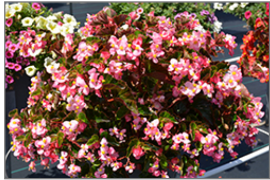
BabyWing Pink Begonia in bloom

BabyWing Pink Begonia is a fine choice for the garden, but it is also a good selection for planting in outdoor containers and hanging baskets. It is often used as a 'filler' in the 'spiller-thriller-filler' container combination, providing a mass of flowers and foliage against which the thriller plants stand out. Note that when growing plants in outdoor containers and baskets, they may require more frequent waterings than they would in the yard or garden.