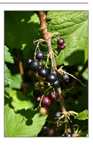
Consort Black Currant fruit