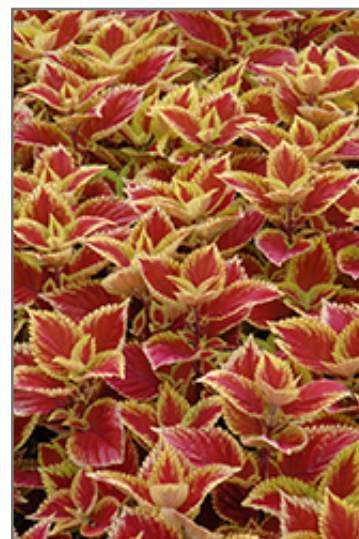
Trusty Rusty Coleus foliage