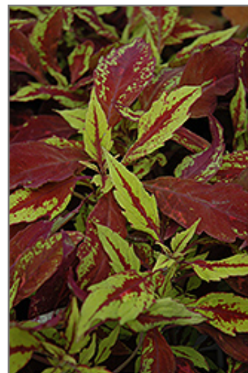
Pineapple Coleus foliage