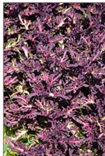
Merlin's Magic Coleus foliage