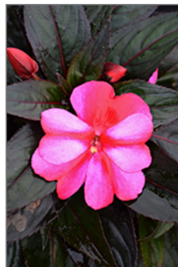
Sonic Sweet Purple New Guinea Impatiens flowers