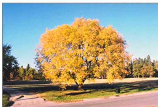
Boxelder in fall