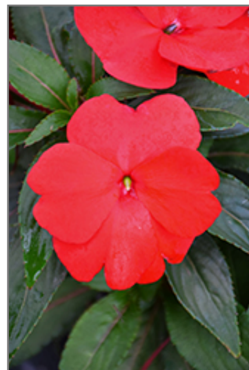
Super Sonic Red New Guinea Impatiens flowers