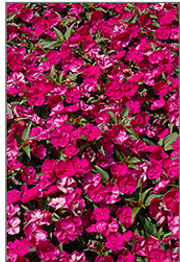
Fanfare Fuchsia Impatiens flowers