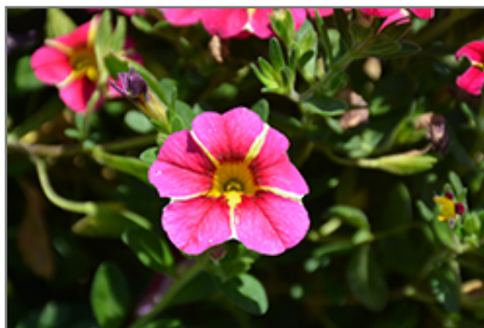
Superbells Cherry Star Calibrachoa flowers

This plant will require occasional maintenance and upkeep. Trim off the flower heads after they fade and die to encourage more blooms late into the season. It is a good choice for attracting bees and hummingbirds to your yard, but is not particularly attractive to deer who tend to leave it alone in favor of tastier treats. It has no significant negative characteristics.