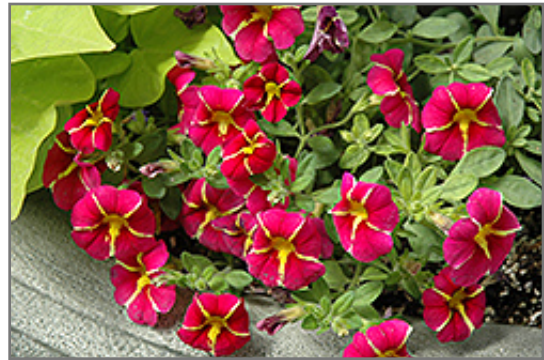
Superbells Cherry Star Calibrachoa flowers

Superbells Cherry Star Calibrachoa will grow to be about 10 inches tall at maturity, with a spread of 24 inches. When grown in masses or used as a bedding plant, individual plants should be spaced approximately 12 inches apart. Its foliage tends to remain low and dense right to the ground. This fast-growing annual will normally live for one full growing season, needing replacement the following year.