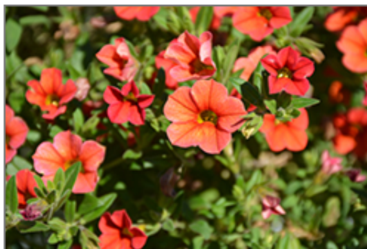
Can-Can Orange Calibrachoa flowers

Can-Can Orange Calibrachoa is recommended for the following landscape applications;