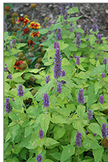
Golden Jubilee Anise Hyssop flowers

Golden Jubilee Anise Hyssop is recommended for the following landscape applications;