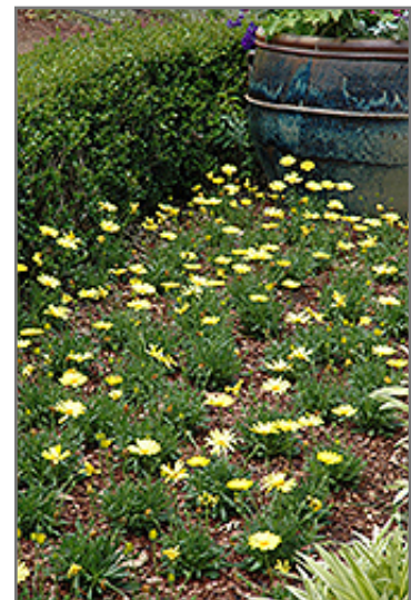
Voltage Yellow African Daisy flowers