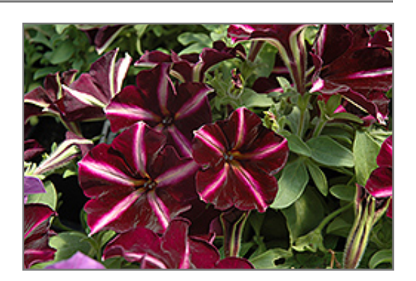
Pinstripe Petunia flowers

Pinstripe Petunia will grow to be about 12 inches tall at maturity, with a spread of 10 inches. When grown in masses or used as a bedding plant, individual plants should be spaced approximately 8 inches apart. Its foliage tends to remain dense right to the ground, not requiring facer plants in front. This fast-growing annual will normally live for one full growing season, needing replacement the following year.